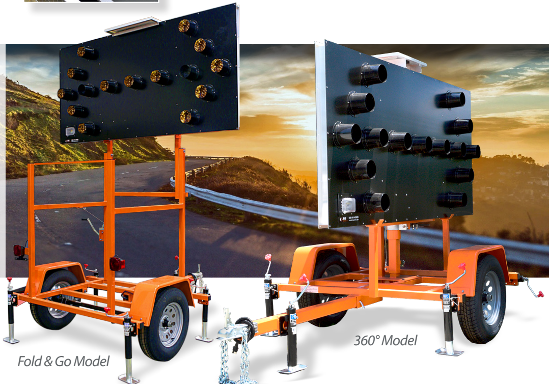
Fold & Go Model