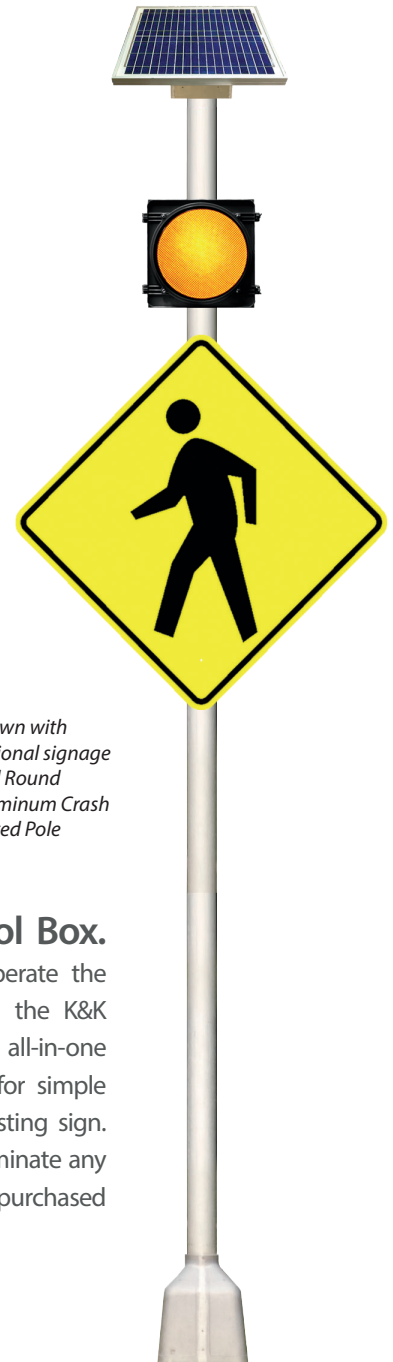
Shown with optional signage and Round Aluminum Crash Tested Pole