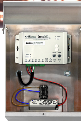
Control Box Clean design for easy maintenance.