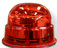
L-810 Obstruction Light