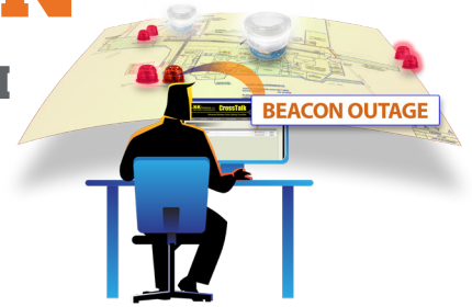
Control and Monitor from Anywhere

The K&K Aviation Backup System is designed for AC powered systems. It works as the primary system and an LED backup system. The CrossTalk Controller utilizes password protected, cloud-based software that allows you to control beacons from the comfort of your desk or on the go. The CrossTalk, located inside the control box, activates the backup beacon and sends a notification via email and/or text to the designated technician if the primary beacon fails. By retrofitting your existing system with K&K LED technology, you can rest assured that your aviation navigational system is always working.