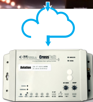
CrossTalk-AV-10 Advanced lighting controller and monitor. Ten year service plan included.