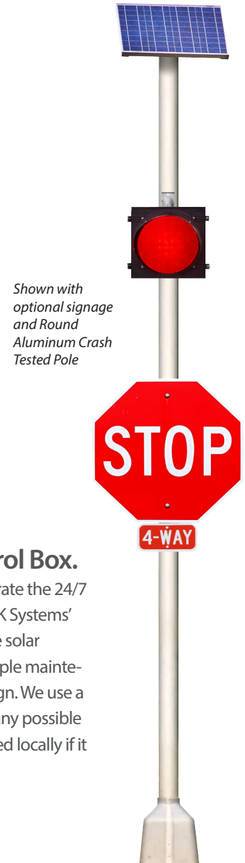
Shown with optional signage and Round Aluminum Crash Tested Pole